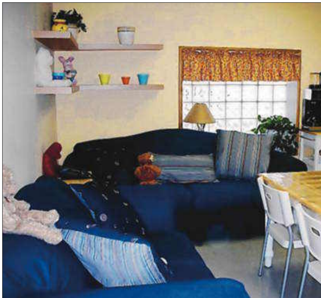
AFTER EFFECTS: Vogel Alcove staff lounge after the Altrusa Dallas makeover.