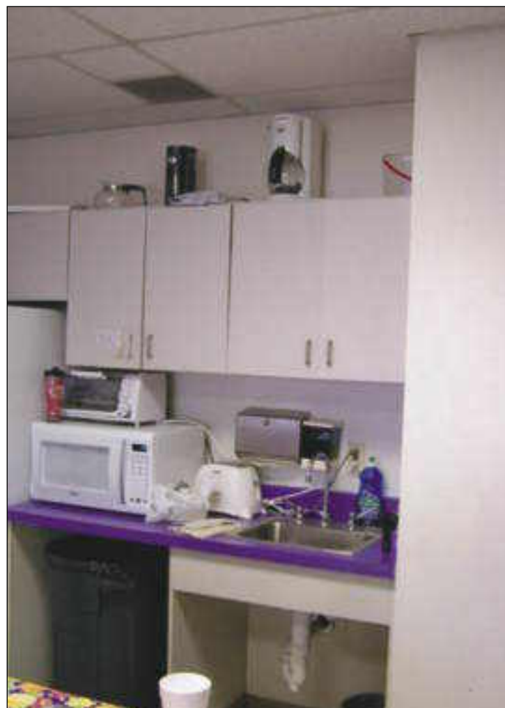
UPDATE NEEDED: Vogel Alcove staff kitchen area before the Altrusa Dallas makeover.