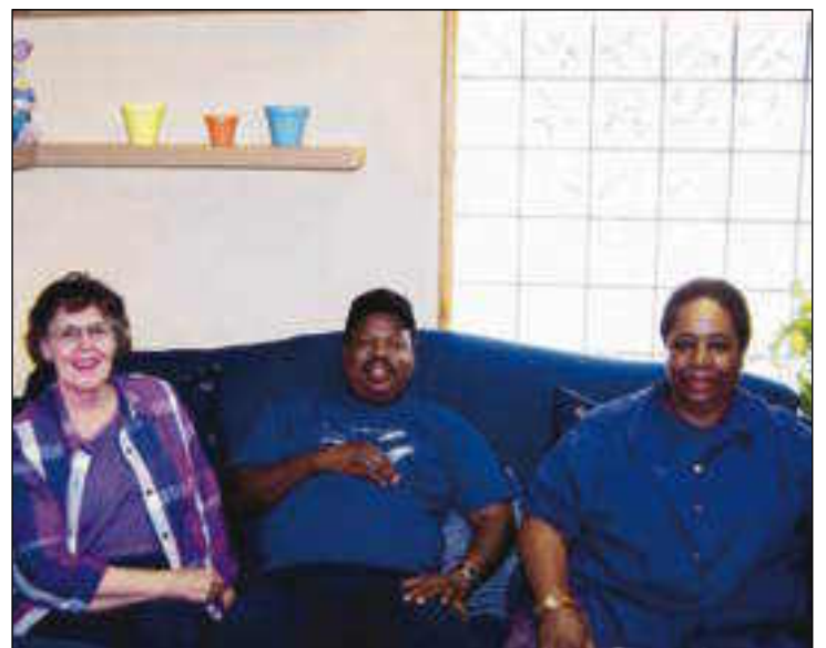
GATHERING AROUND: Vogel Alcove staff members enjoy the renovated staff lounge.