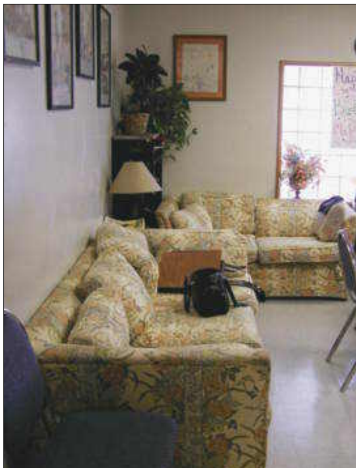
LOUNGE AREA: Vogel Alcove staff lounge before the Altrusa Dallas makeover.